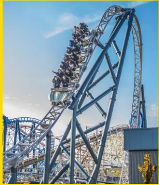
Blackpool Pleasure Beach